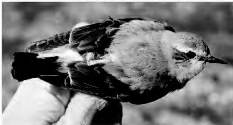
Northern Wheatear fitted with a satellite transmitter

Miniature tracking devices have revealed the epic 30,000 km migration of the diminutive Northern Wheatear Oenanthe oenanthe . These birds, which weigh just 25 gm, travel from sub-Saharan Africa to their Arctic breeding grounds. Scientists report that, when scaled by body size, this is one of the longest round-trip migratory journeys of any bird in the world. The species is of particular interest to scientists, because it has